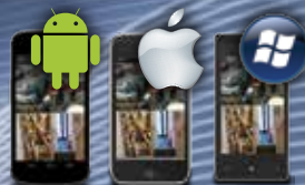
SMART PHONE COMPATIBLE

8/16 CHANNEL 1.5U STANDALONE DVR, WITH DVD WRITER